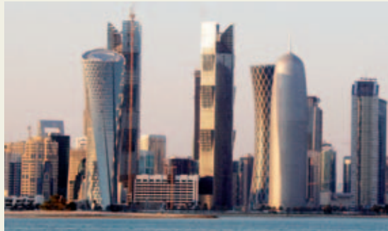
Unique and innovative skyscrapers make up Doha's modern skyline, giving viewers a glimpse of the ongoing development of the nation

In economic terms, Qatar is not just strong; it is also stable. While many countries are