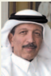
Yousef Hussain Kamal Minister of Finance

Qatar is proving to be a highly stable GCC country, thanks to its prudent macroeconomic and natural resource management.