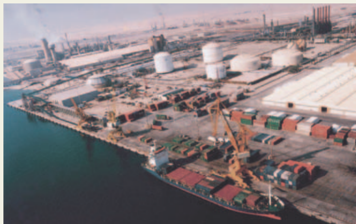
Mesaieed Industrial City features a fully serviced, 24-hour commercial port spanning 46.6 square miles – all strategically located just 25 miles from Doha

"There are a number of incentives luring foreign investors into MIC, such as the abundance of energy resources, no export duties, no custom duties on machin-